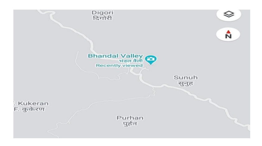
FIGURE: 2.1 Google map of Bhandal valley showing the location of surveyed place.