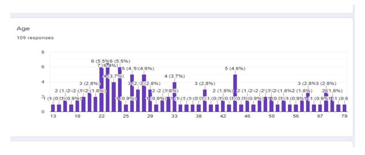
FIGURE: 3.3 Showing different age groups of the informants responded for current study

In Salooni, District Chamba, 109 people were interviewed through Google from under prevailing by pandemic situation. 53.7% of males and 46.3% females were interviewed. 17% of interviewers were students, 9% were from educational department (Teacher), in which 7% females were house wives, and 5% people were involved in agriculture (farmers). It also includes the people from banking sector, Government employee, doctor, Politician, physician, farmer; nurse etc. 109 responses recorded which shows 99.1% belongs to the rural area. It has been observed that mainly people belong to the 22-25 age group, 5% people belongs to 44.